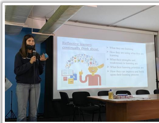
Students present the results of their research in the 'Reflective Learner' field during a youth exchange in Palermo.

The school must be more than a factory. Let's not get carried away by the obsession with results. Pupils are not a factory product, they are people. We want a school where students enjoy learning and are not afraid to make mistakes; we want students who can show kindness to other people and care for our Planet.