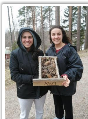
An insect house built by students during a youth exchange in Mäntsälä.